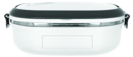
3. LEFT SIDE