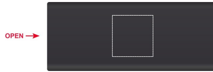
2. BACK PAD