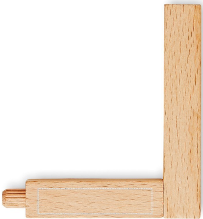
4. SUPPORT 5