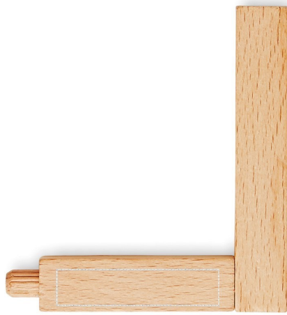
2. SUPPORT 2